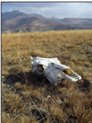
Remains of a Carcass at the Vulture Restaurant, Golden Gate Highlands National Park

Upon returning to the UK, I started an internship with The Climate Group in London. I was lucky enough to be there during the COP-15 conference at Copenhagen, so had a fantastic opportunity to learn about the workings of environmental NGOs in relation to the UN.