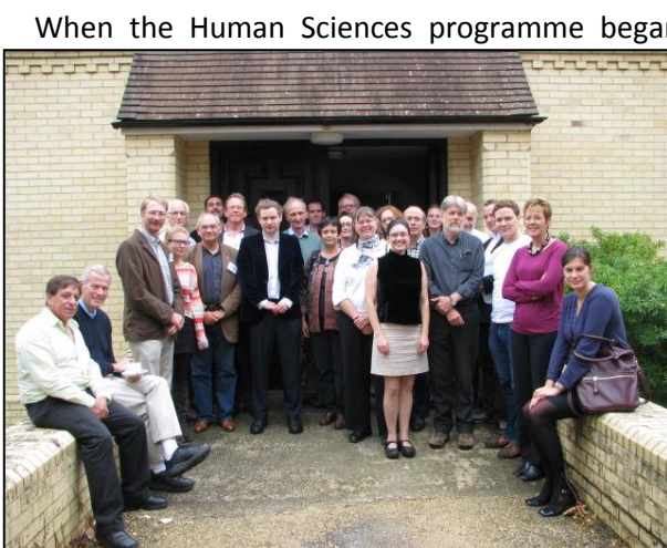
Participants at the Population in the Human Sciences conference